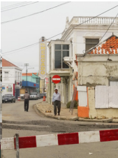
2. In-between cultures

"How did it happen that there are almost only Chinese supermarkets on the island?" "Oh, they came on one point." Is there not any Aruban supermarket culture to take care of? How easy get cheaper on the islands accepted without any revolt? Is it straightforward hospitality or a new form of non-national behaviour of the inhabitants on this island?