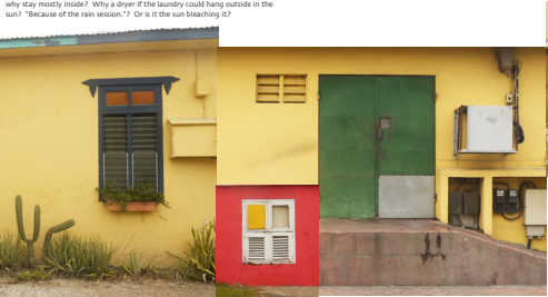
1. Outside in the garden

More or less for the whole year the heat is between 27°/75° C. A constant warm temperature like of a never ending summer. Sure it can be too much and an air conditioning system might be desirable. But riding along the Aruban houses very seldom are people sitting in a tree's shadow or a couple of chairs. There have been great (historic) ideas on the island on natural built in air conditioning for the house and protection against mosquitos, so why stay mostly inside? Why a dryer if the laundry could hang outside in the sun? "Because of the rain season."? Or is it the sun bleaching it?